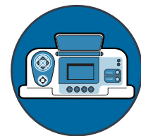
MMI – interactive digital interface