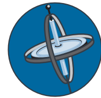
Gyro XL scanning